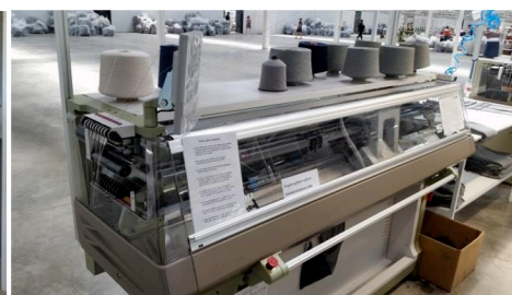
Figure 3: Electronic Flat Knitting Machine